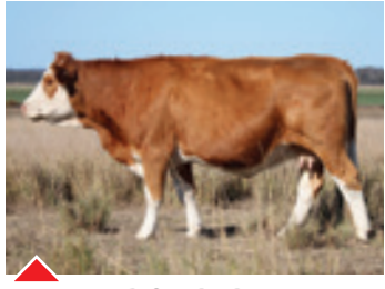
Dam: MELDON PARK K1615