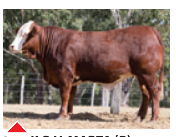
Dam: K.B.V. MARTA (P)

COMMENTS: Parentage verified, BVDV negative, Homozygous recessive red, polled.