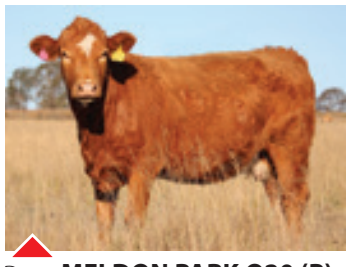
Dam: MELDON PARK Q20 (P)