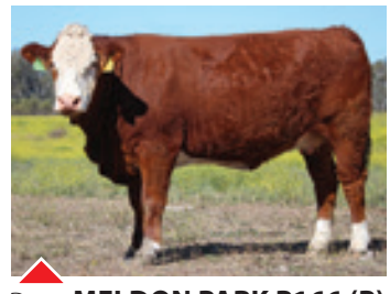
Dam: MELDON PARK P166 (P)