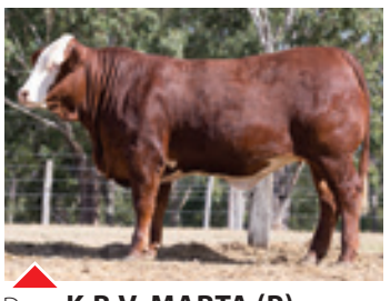
Dam: K.B.V. MARTA (P)

COMMENTS: Parentage verified, BVDV negative, Homozygous recessive red, polled.