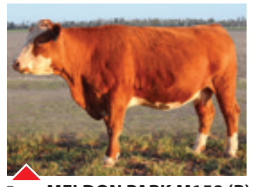
Dam: MELDON PARK M158 (P)