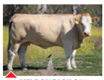
Dam: MELDON PARK Q70