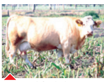
Dam: MELDON PARK J1458 (P)