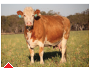
Dam: MELDON PARK K1568 (P)