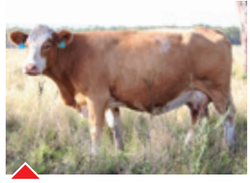
Dam: MELDON PARK H1204 (P)